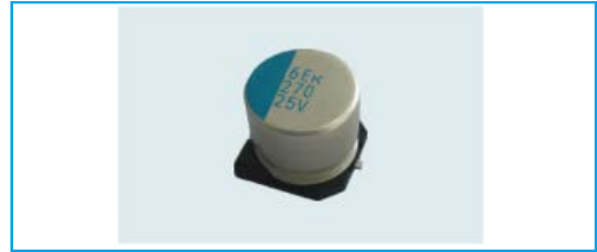
Marking color : Blue print