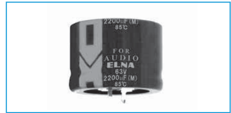
Marking color : Gold print on a black sleeve